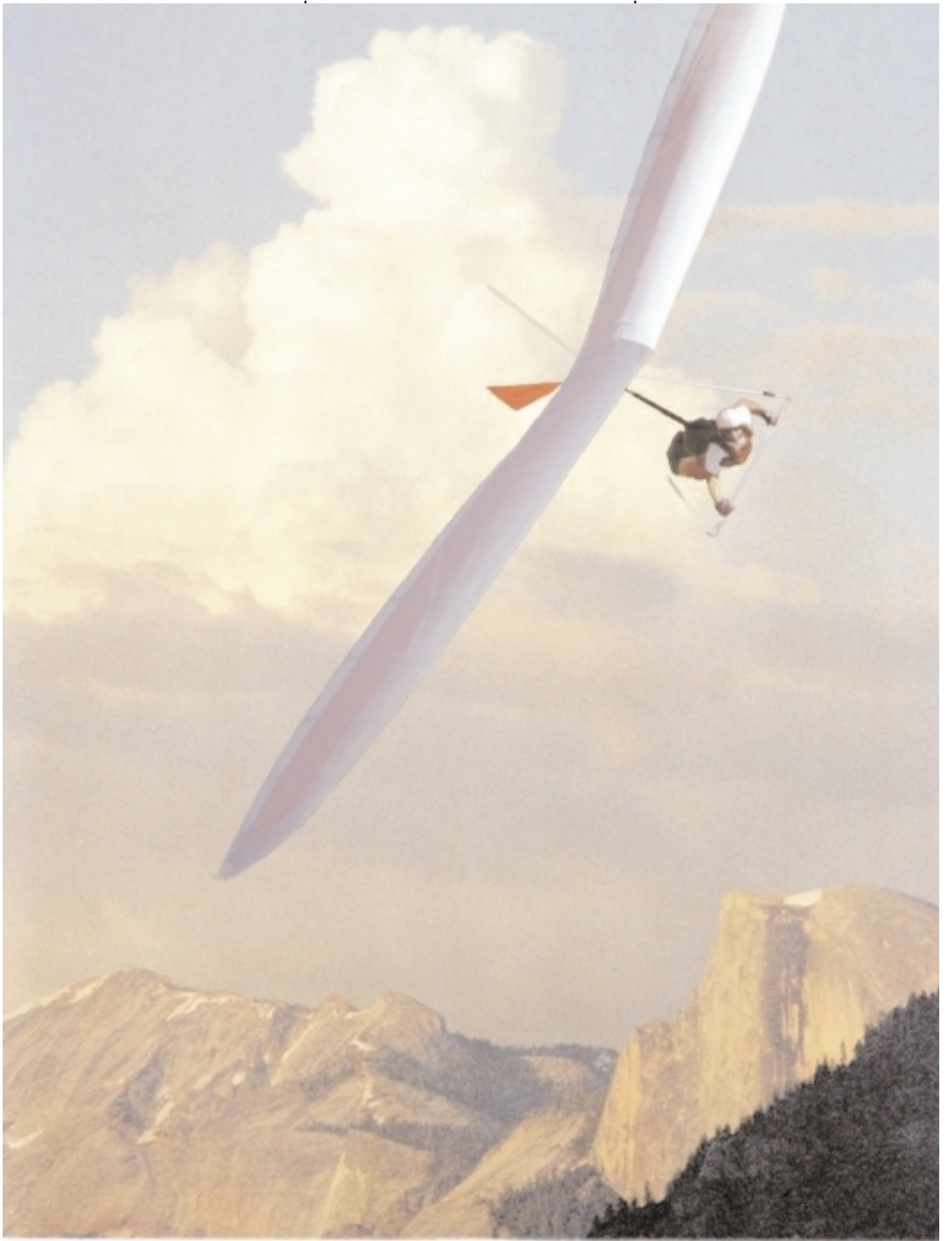
Who needs swimsuits when we've got gliders? Thanks to Art Thompson for this one!