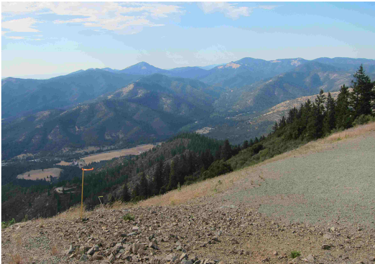
Woodrat Launch

The publication of the Wings Of Rogallo Northern California Hang Gliding Association Volume-134, Number 6 August 2015