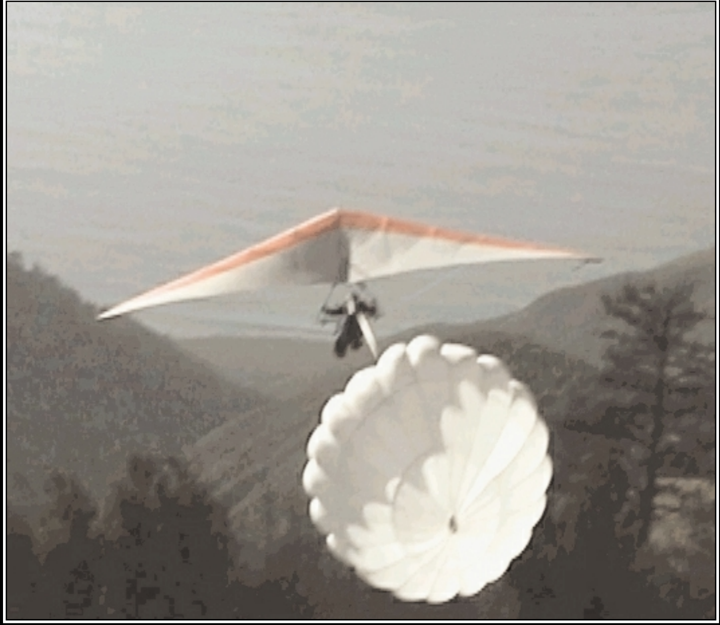
Another Microsoft Moment!

In This Issue: Wings for Sale Ed Levin's Bovine Legions 3 7 January Meeting Minutes Next Meeting 8 3 Officers 2 High Energy Sports to Move 4 The Editor's Turn 2 Tollhouse Cookies Flyin-in 5 2 Big Sur! Secret Renewal Form (shh)