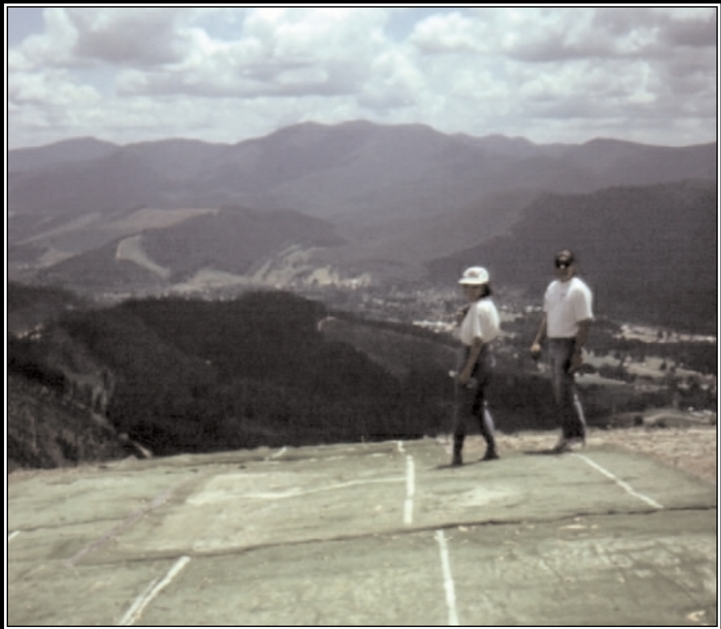
Bright Launch, Australia -- the Place Where Old Tennis Courts go to Die...