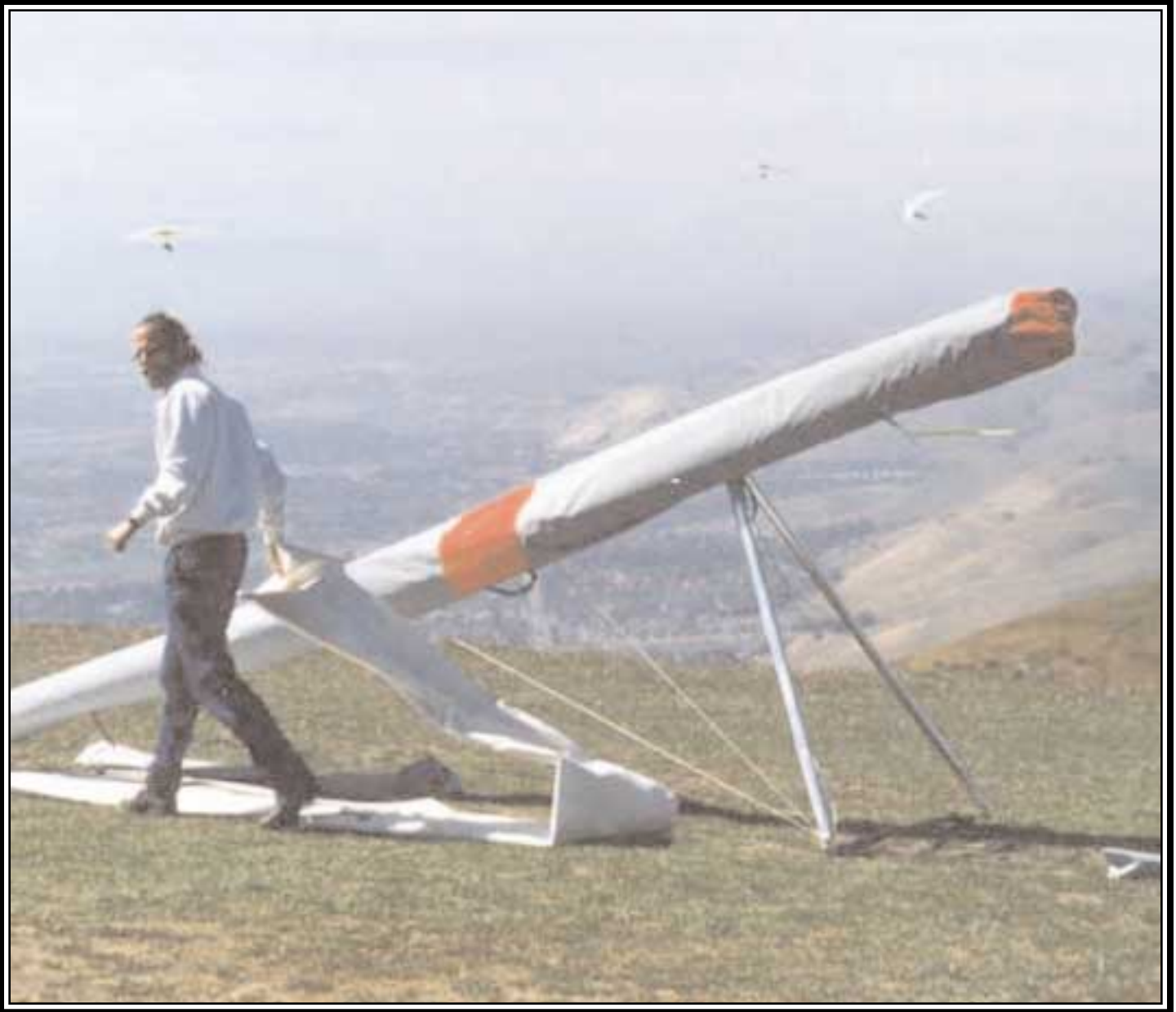
Setting up on a good day at Mission

THE PUBLICATION OF THE WINGS OF ROGALLO NORTHERN CALIFORNIA HANG GLIDER ASSOCIATION VOLUME 101, NUMBER 01, JANUARY 2001