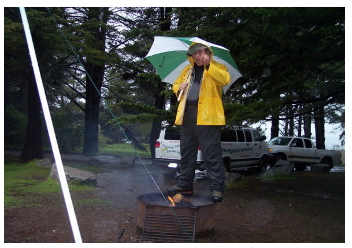
Dec 30th at Big Sur. (it did get much better)

The publication of the Wings Of Rogallo Northern California Hang Gliding Association Volume-116,Number 1 January 2005