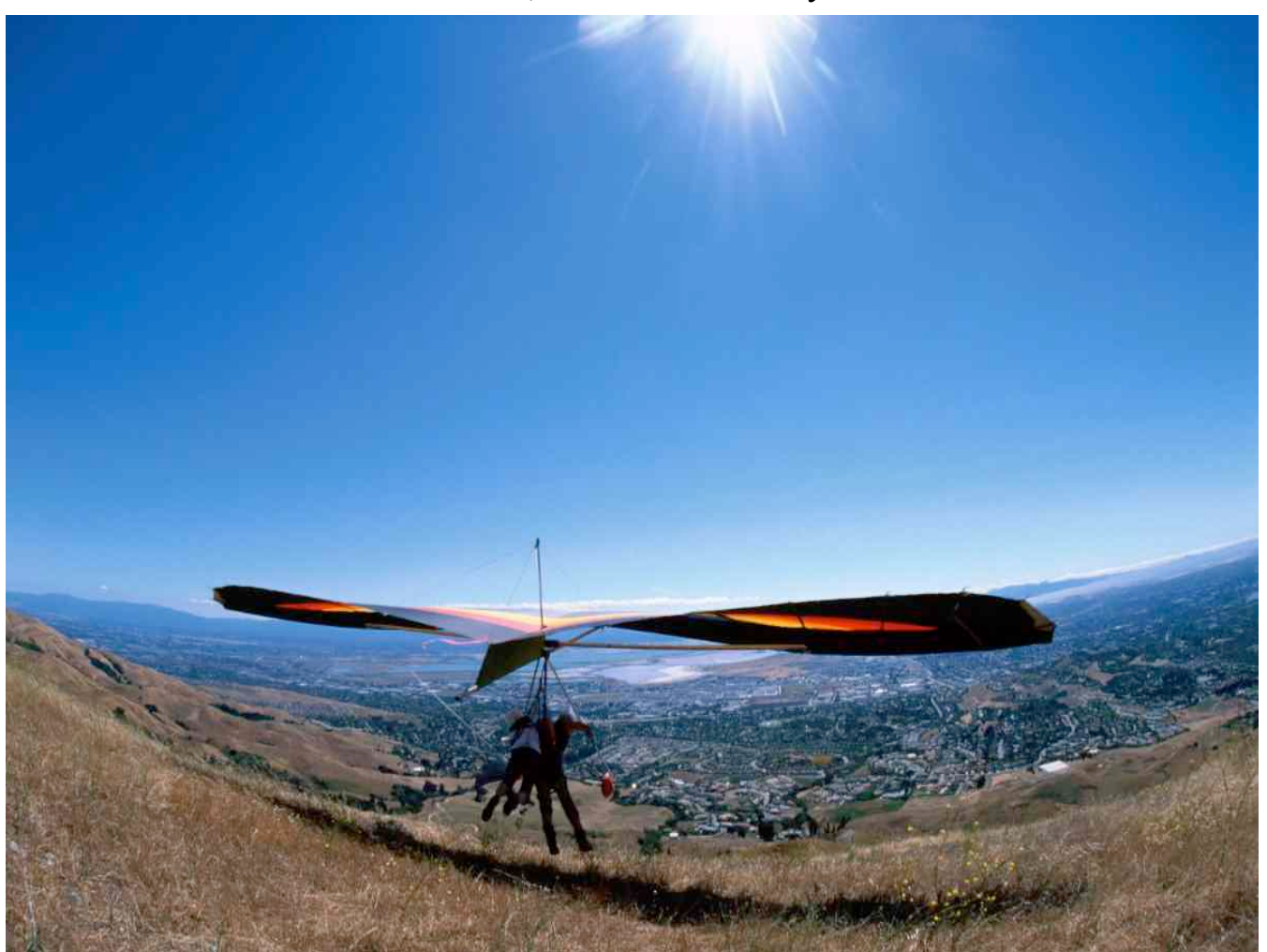
A GoodLookingRichGuy doing a tandem launch @ Mission

The publication of the Wings Of Rogallo Northern California Hang Gliding Association Volume-126, Number 1 January 2008