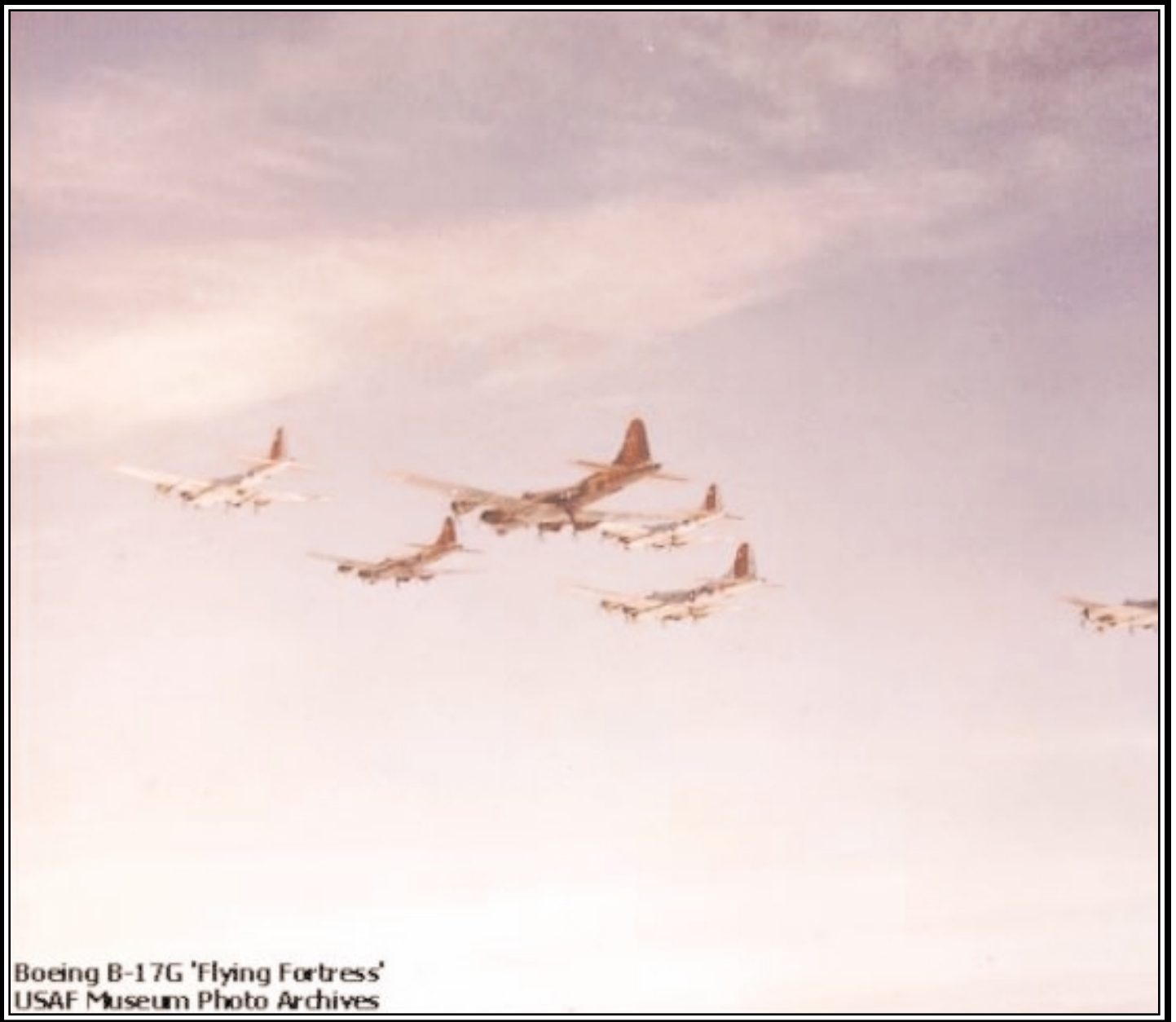
Boeing B-17G 'Flying Fortress'

THE PUBLICATION OF THE WINGS OF ROGALLO NORTHERN CALIFORNIA HANG GLIDER ASSOCIATION VOLUME 101, NUMBER 06, JUNE 2001