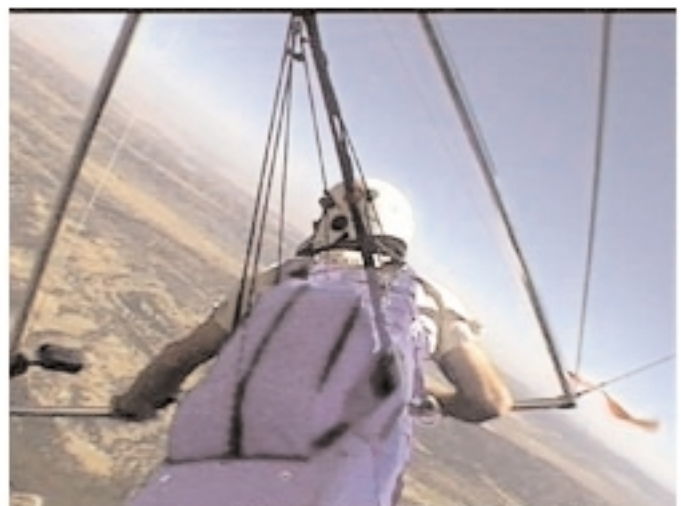
Video Still #4 Elk Creek

All images of Brian Peterson. Original resolution is 1.38mb captured from DV camcorder.