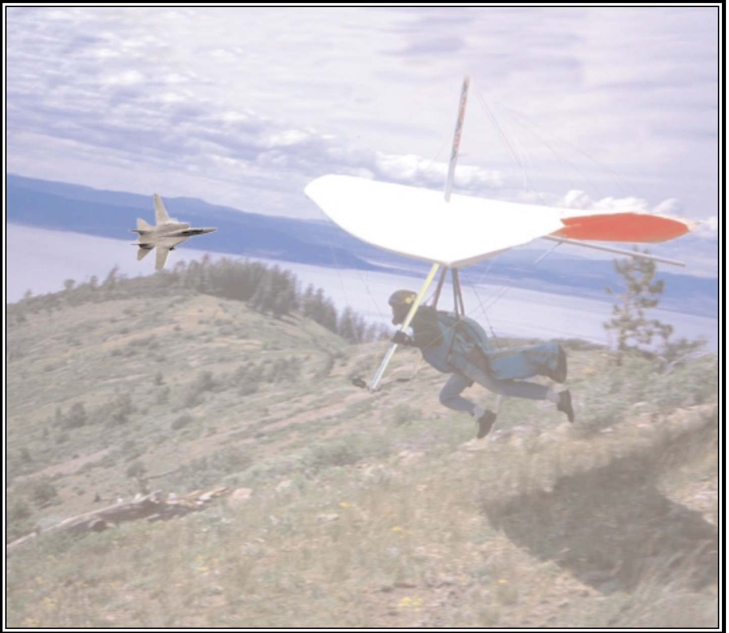
Always check for traffic before launch

THE PUBLICATION OF THE WINGS OF ROGALLO NORTHERN CALIFORNIA HANG GLIDER ASSOCIATION VOLUME 102, NUMBER 6 JUNE 2002