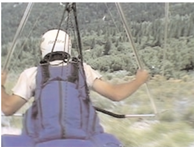
Video Still #3 Elk Creek