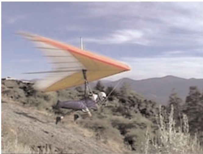
Video still #1 Hat Creek

Good job, Vince! And good luck at Chelan!