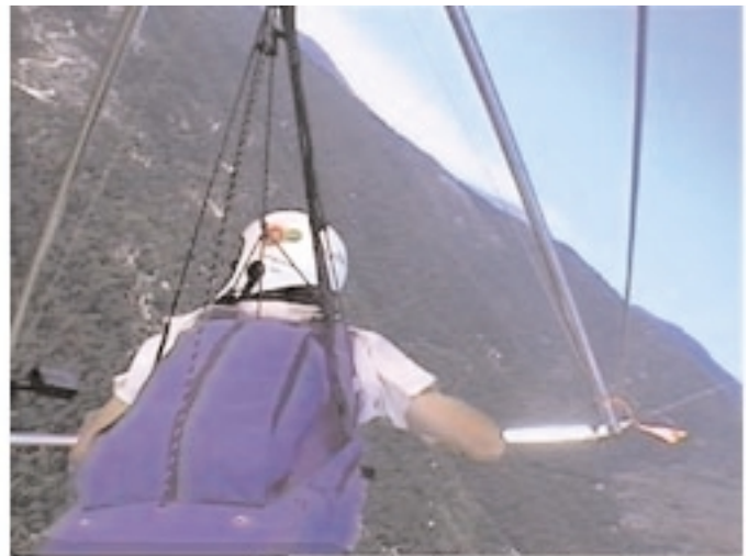
Video Still #2 Elk Creek