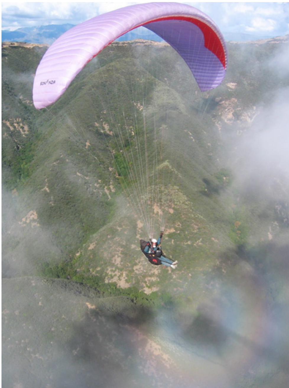
Glory Be!! Sure is Fun Flying in Santa Barbara