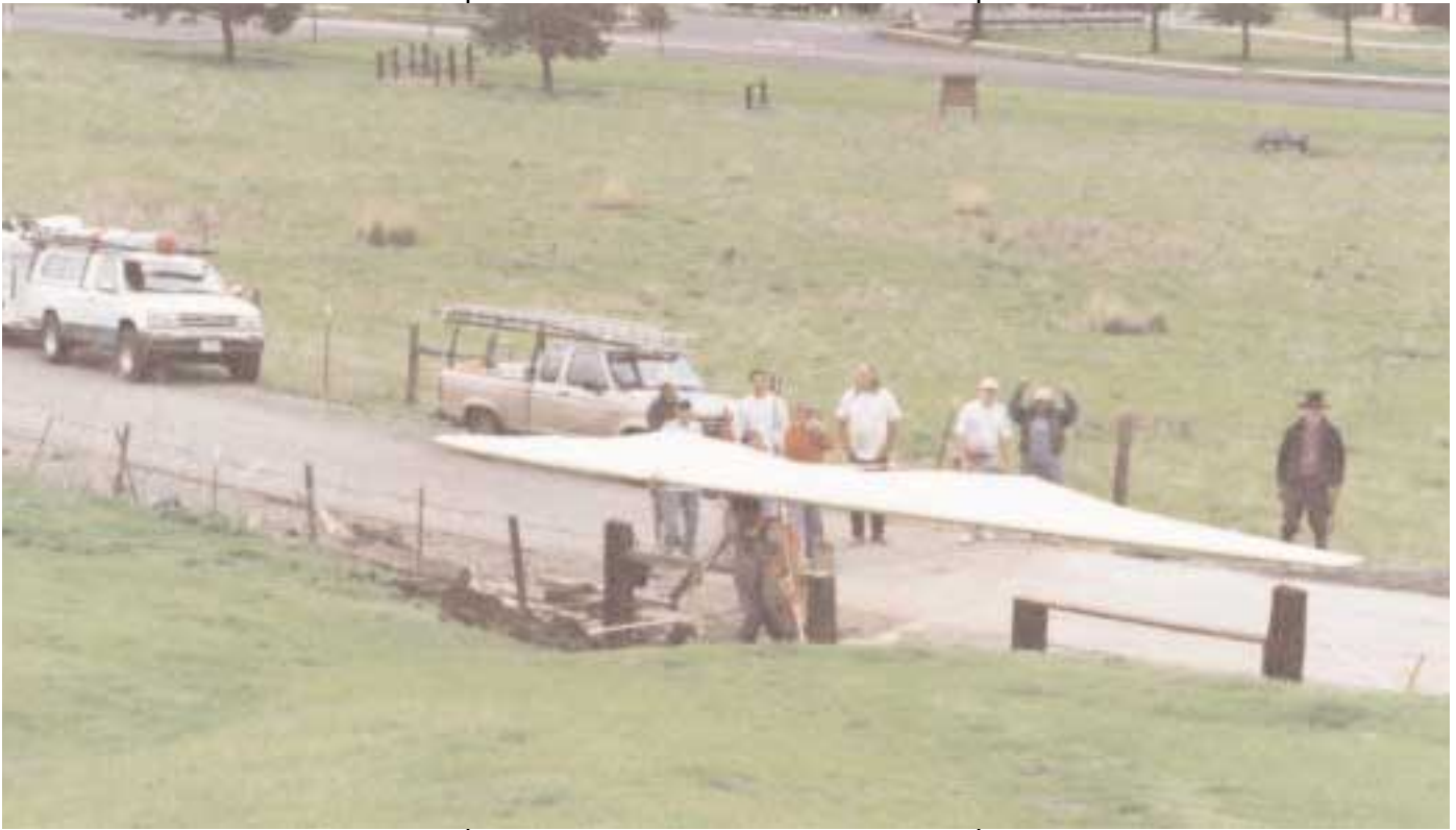
It works for gliders! But will it work for cows?

ally remains fairly mellow. It's a good place and a good time of year to get back in shape, blow some of the dust off after a long winter sitting on the shelf, remember which ends of the battens go toward the front ("Umph! Grunt! Oops, now I remember!"), and remind yourself how to land ("Oops!" "WHACK!" "Not that way.")