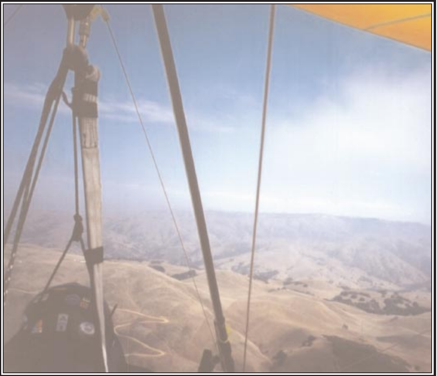
This site look familiar? Read the story, page 3!

THE PUBLICATION OF THE WINGS OF ROGALLO NORTHERN CALIFORNIA HANG GLIDER ASSOCIATION VOLUME 100, NUMBER 11, NOVEMBER 2000